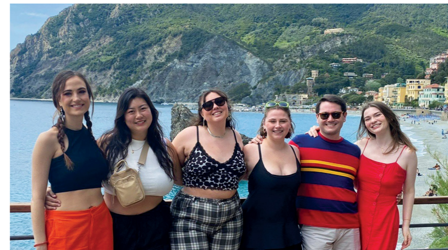
Rice students in Italy, summer 2022.