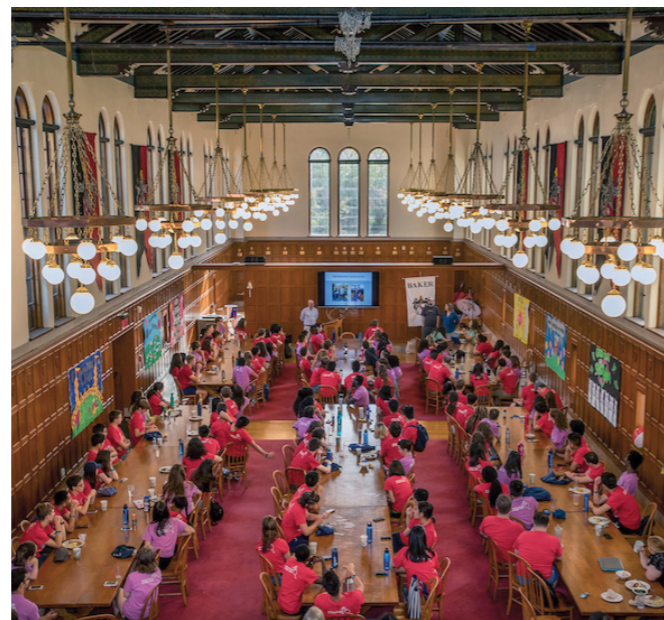
Baker College commons