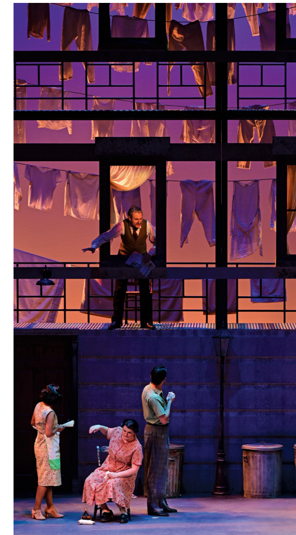
The Shepherd School of Music’s production of “Street Scene,” fall 2022.